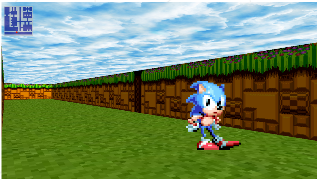
Figure VIII.3: Example of the bonus part with a minimap, floor and ceiling textures, and an animated sprite of a famous hedgehog.