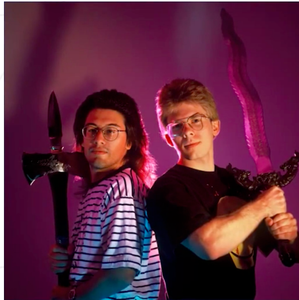
Figure I.1: John Romero (left) and John Carmack (right) posing for posterity.

Developed by Id Software, led by the world-renowned John Carmack and John Romero, and published in 1992 by Apogee Software, Wolfenstein 3D is the first true “First Person Shooter” in the history of video games.