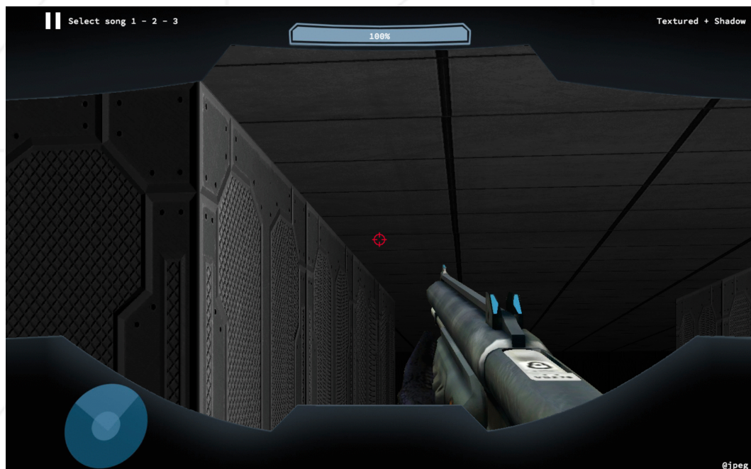
Figure VIII.5: Another example of a bonus game with a weapon of your choice and the player looking at the ceiling

Note: This document may contain copyrighted images. We consider that this subject, created for educational purpose, falls under the Fair Use guidelines.