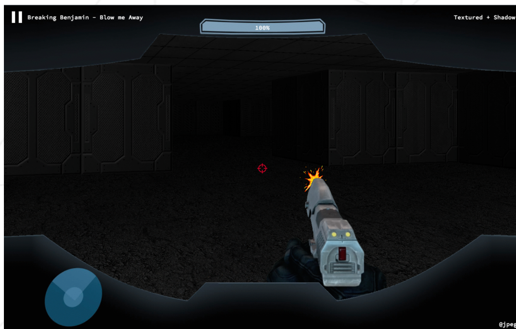
Figure VIII.4: Another example of a bonus with a HUD, health bar, shadow effect and weapon that can shoot