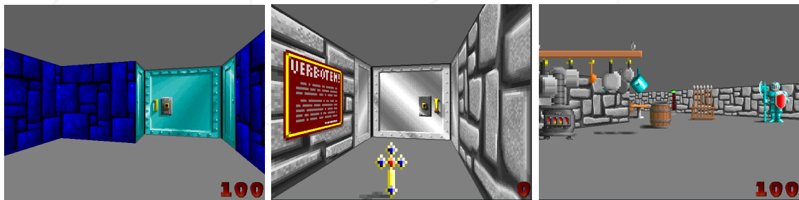
Figure VIII.1: Wolfenstein3D original design replica, using RayCasting.